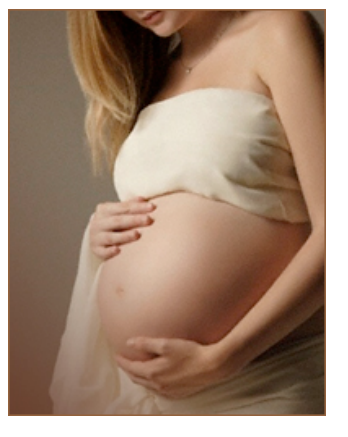
MEMBERS SECTION Money, Sex, and Power